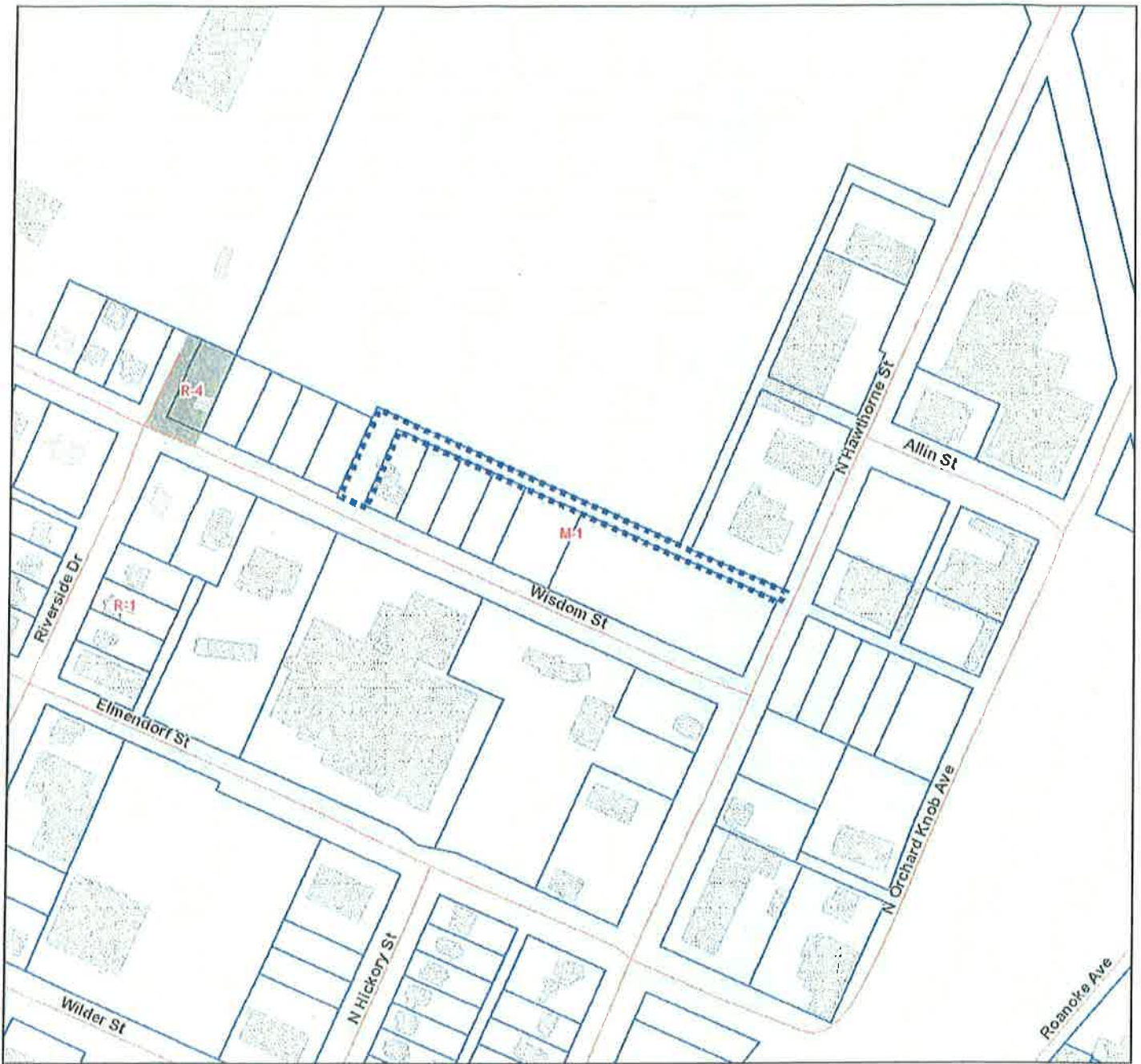
MR 2014-135 Abandonment of an Unnumbered Blk of 4th St and an Unopened Alley beginning on the North Line of Said Street